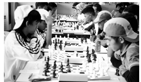
Players examine each move their opponents make during the game.

Cagayan State University Carig Library - Region V and VI displayed their analytical prowess in the chess battle field in the first round of both Chess Men's and Women's division, Feb. 8.