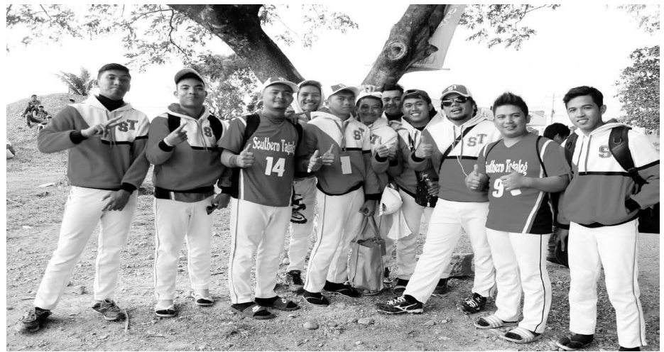
Southern Tagalog softballers wear happy faces after their first win.

Furthermore, in the second game of Men's Single Division between ARMM and R08 in, ARMM again captured victory after beating R8 with a score of 6-3.