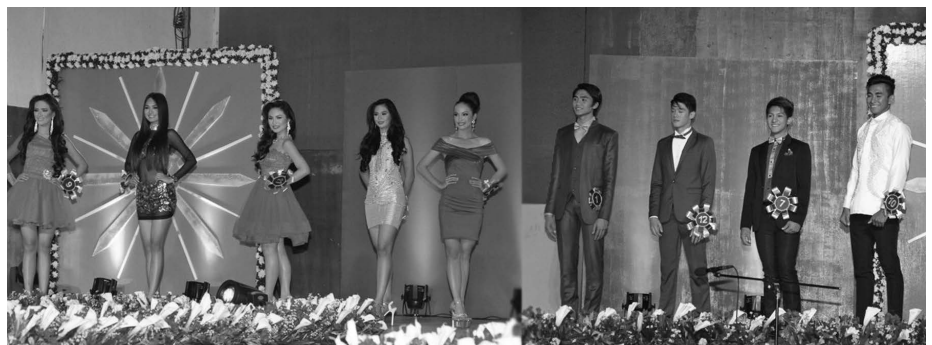
The finalists of the Ms. and Mr. SCUAA 2015 enjoy the moment after their names were called to complete the top 5.