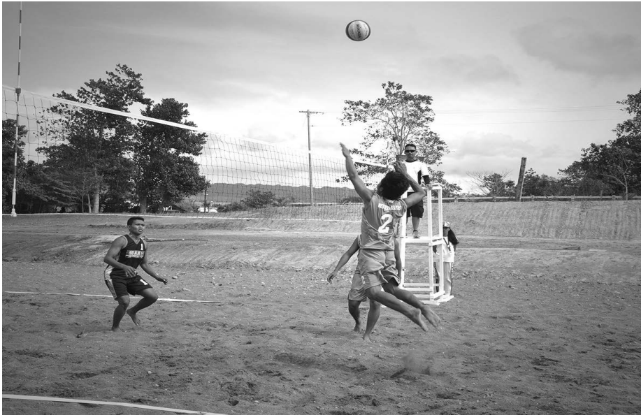
FIRST BLOOD. Region 7 spikers go for the kill during their first beach volley win.

By Ma. Aiza delos Reyes and Donnabelle Maquimot